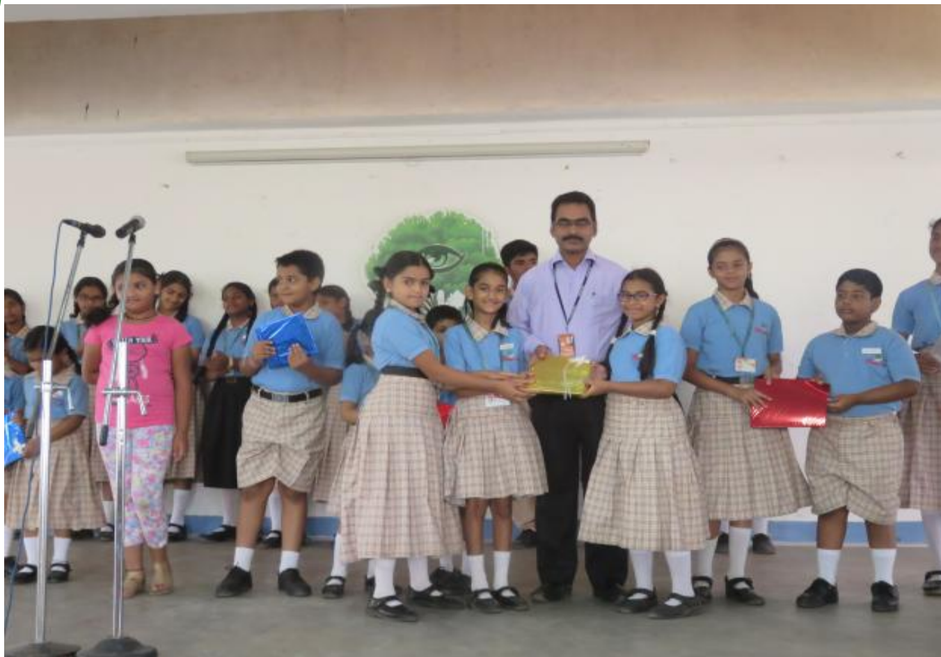
Book Reading Club was inaugurated by our Principal Sir on 31st July 2018 Scholastic Lucky Dip Winners: Chemistry Lab