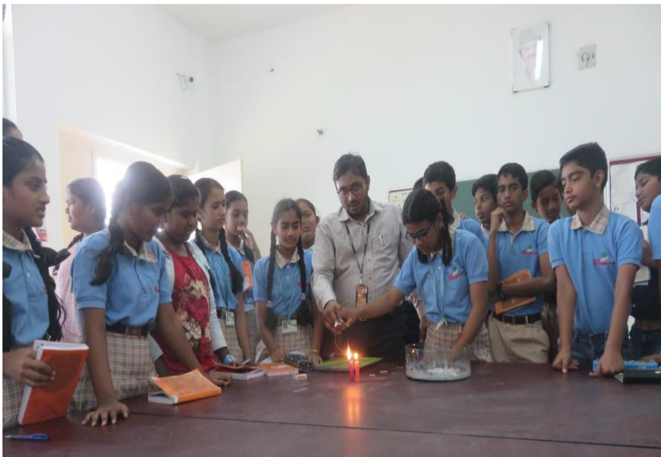
Chemistry Lab Experiment