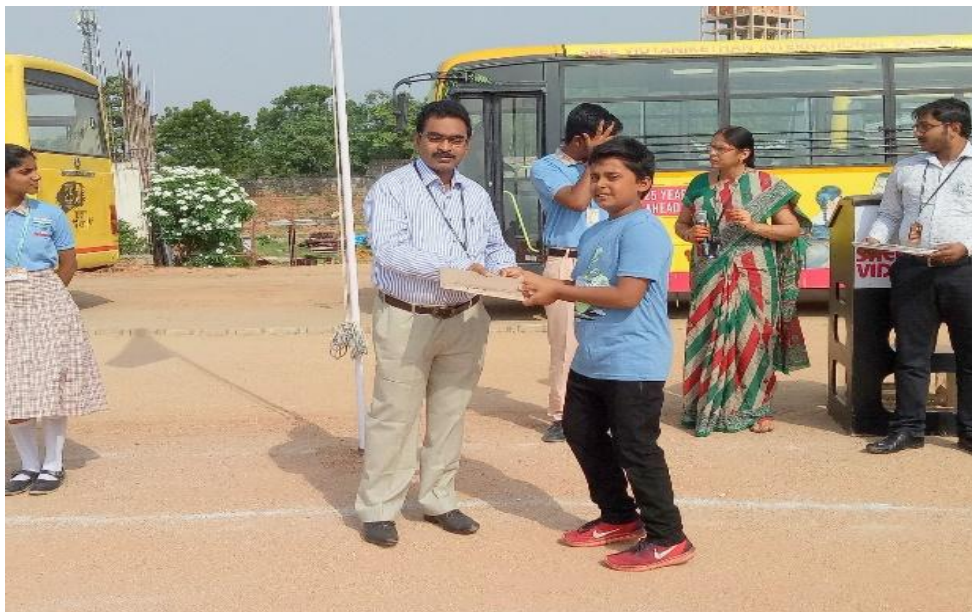
Scholastic Lucky Dip Winners: Chemistry Lab